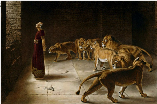
Daniel in the Lion's Den (Daniel 6)