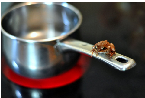
The Proverbial Apologue of the Frog in the Kettle