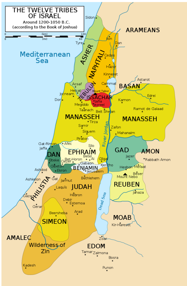
Location of Ephraim