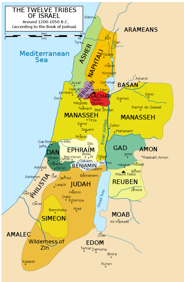
Note Locations of Ephraim, Jordan and Moab

And he said to them, " Pursue (imperative - command) them , for the LORD has given (Lxx - paradidomi ) your enemies the Moabites into your hands - Ehud encouraged the sons of Israel that the victory was guaranteed because the Lord had given the Moabites into their hands. As explained earlier to "give into the hand of" is an idiom which means "to deliver over to the power of," and in essence "to enable to conquer."