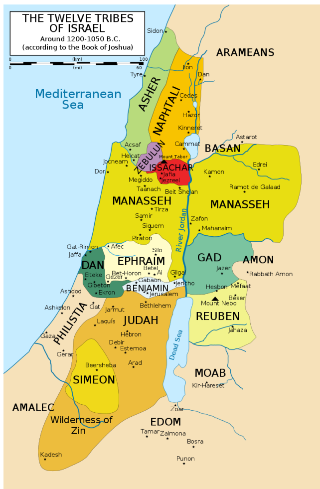
Note Locations of Ephraim, Jordan and Moab

And he said to them, " Pursue (imperative - command) them , for the LORD has given (Lxx - paradidomi ) your enemies the Moabites into your hands - Ehud encouraged the sons of Israel that the victory was guaranteed because the Lord had given the Moabites into their hands. As explained earlier to "give into the hand of" is an idiom which means "to deliver over to the power of," and in essence "to enable to conquer."