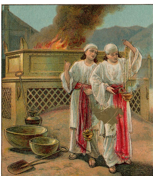
THE SIN OF NADAB AND ABIHU Lev. 10:1-11. GOLDEN TEXT:—Wine is a mocker, strong drink is raging; and whosoever is deceived thereby is not wise. Prov. 20:1.

Leviticus 10:1; 2+ Now Nadab and Abihu, the sons of Aaron, took their respective firepans, and after putting fire in them, placed incense on it and offered strange fire before the LORD, which He had not commanded them. 2 And fire came out from the presence of the LORD and consumed them, and they died before the LORD