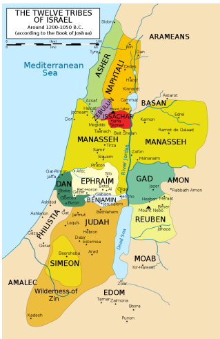
Benjamin - Click to Enlarge

Genesis 44:20 "We said to my lord, 'We have an old father and a little child of his old age. Now his brother is dead, so he alone is left of his mother, and his father loves him.'