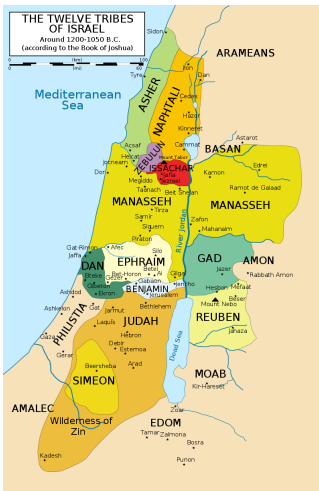
Gad Click to Enlarge Look at map showing shrinking of the lands of Reuben, Gad, Manasseh by 830 BC!

Of Gad he said, "Blessed ( barak ) is the one who enlarges Gad - "Blessed is the one who enlarges Gad's territory!" (Dt 33:20NLT) The blessing would seem to actually be bestowed on Yahweh Himself for He is the One Who can truly enlarge territory.