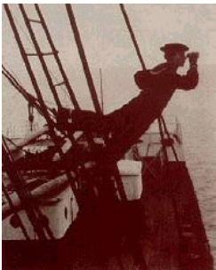
Buster Keaton looking expectantly

John 17:24 "Father, I desire that they also, whom You have given Me, be with Me where I am , so that they may see My glory which You have given Me, for You loved Me before the foundation of the world.