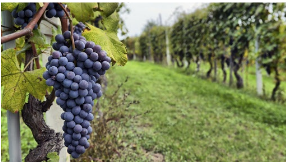
The Vine was a Symbol of Israel Who Was to Bear Fruit

Ezekiel 17:6-10 "Then it (ISRAEL) sprouted and became a low, spreading VINE with its branches turned toward him, but its roots remained under it. So it became a VINE and yielded shoots and sent out branches. 7 "But there was another great eagle with great wings and much plumage; and behold, this VINE bent its roots toward him and sent out its branches toward him from the beds where it was planted, that he might water it. 8 "It was planted in good soil beside abundant waters, that it might yield branches and bear fruit and become a splendid VINE ." 9 "Say, 'Thus says the Lord GOD, "Will it thrive? Will he not pull up its roots and cut off its fruit, so that it withers—so that all its sprouting leaves wither? And neither by great strength nor by many people can it be raised from its roots again. 10 "Behold, though it is planted, will it thrive? Will it not completely wither as soon as the east wind strikes it—wither on the beds where it grew?"'"