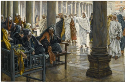
Jesus Pronouncing Woes on Religious Leaders

Matthew 15:14+ "Let them alone; they are blind guides of the blind. And if a blind man guides a blind man, both will fall into a pit."