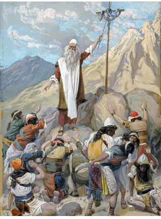
Numbers 21:5-9+ James Tissot